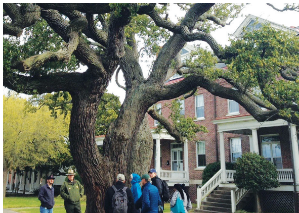
A “witness tree” at Fort Monroe National Monument.